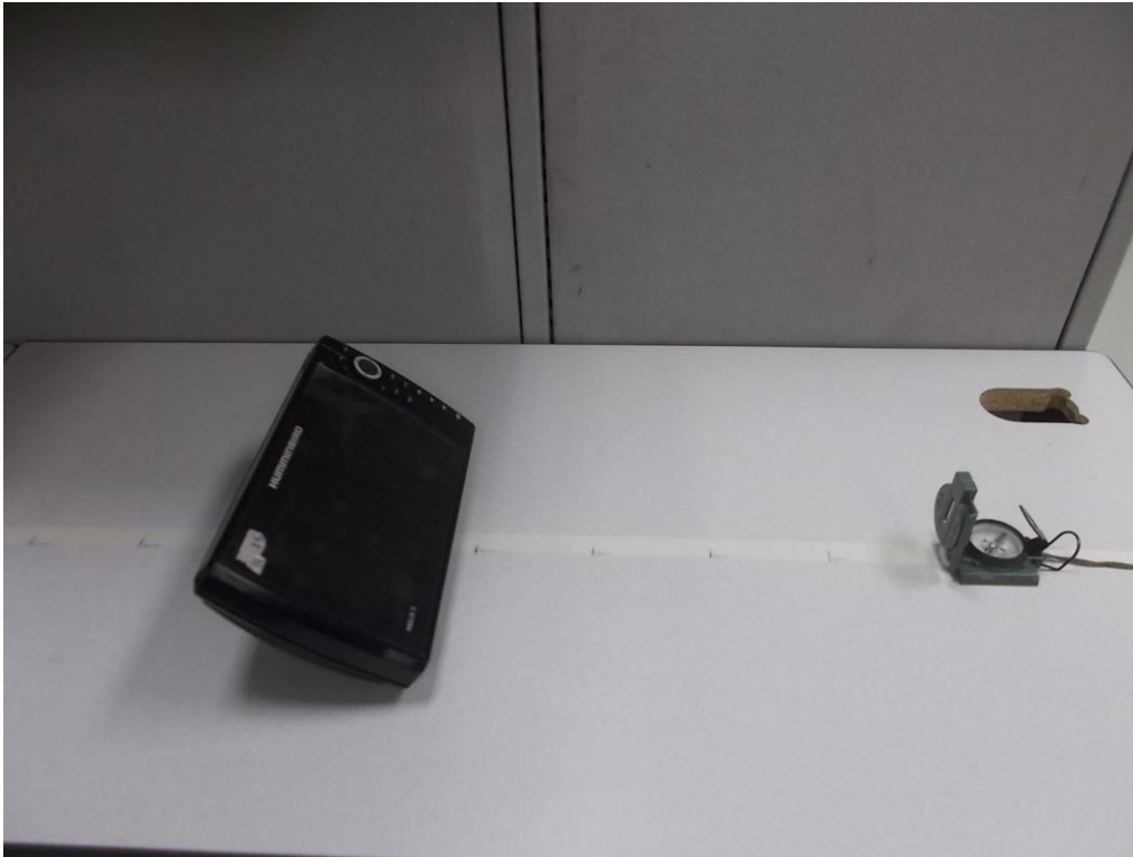
Figure 1.3-1: Compass Safe Distance Test Setup